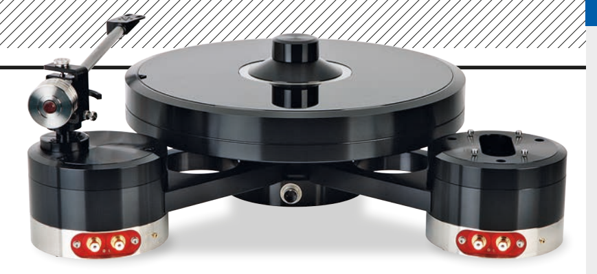
ABOVE: The PSU for the heated bearing connects via an umbilical [centre]. Each 'quick release' tonearm outrigger has captive leads that connect into the underside of the chosen arm and are terminated in gold-plated RCAs to the outside world

of low-level detail. Things snap into place and one feels like the fog has lifted from the recording. The effect is clear everywhere, from its deep, extended bass – which starts and stops snappily – to the treble, which is finely etched, spacious and crisp.